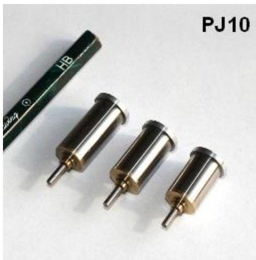
Table 1: Features

It is for DC, step or servo motor that the power is less than 2 W. The continuous output torque is 0.01-0.15 Nm.